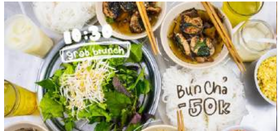
4 Bún Chả