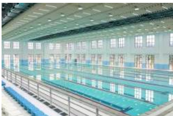
Indoor Sports complex