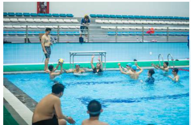
Indoor Sports Complex