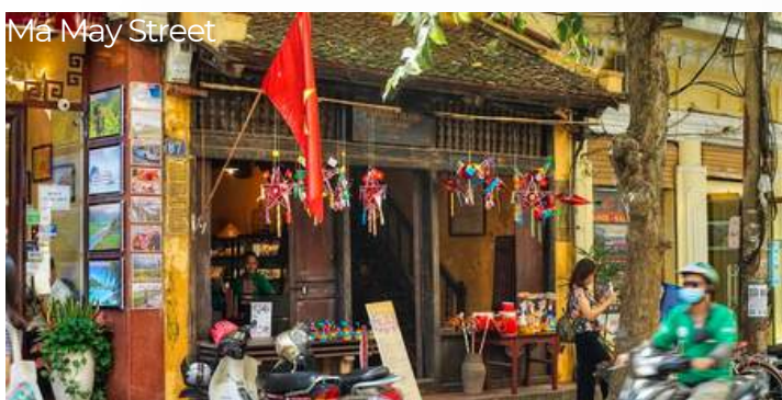
Ma May Street

Ma May Street: Known for traditional Vietnamese houses and antique shops.