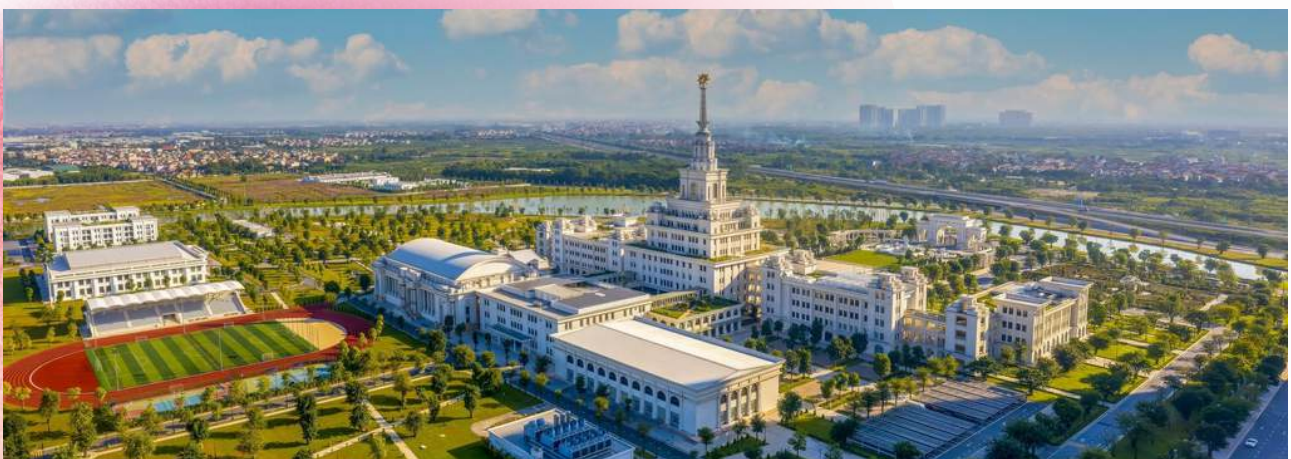
VinUniversity campus overview

The campus is located in Vinhomes Ocean Park in the Gia Lam District, Hanoi, Vietnam, with a total area of 420 hectares. With only a 19% building density and with 117 hectares dedicated to trees and natural areas, the campus will be an ideal setting for self-directed and collaborative learning, peaceful introspection, and inspirational beauty.