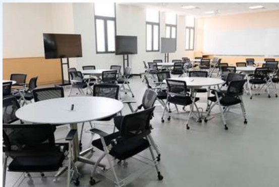
Team-based learning classroom

The landscape, architecture, and interior at VinUniversity deliver the optimal learner-centered environment. Lecture halls and classrooms is designed to enable a highly flexible and adaptable active learning environment, suitable for lectures, interactive and collaborative learning models.